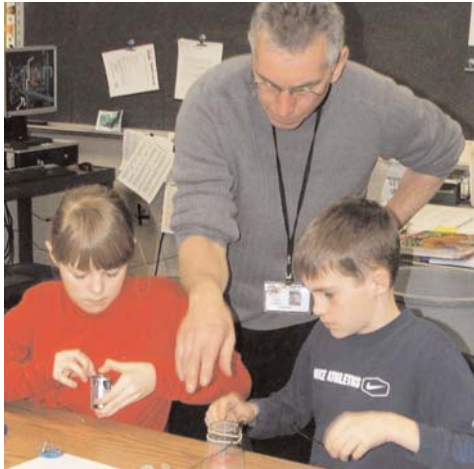
Hands-on translates to excitement, involvement, and interest in science!

School children in various grade levels at schools around the area learn from Einstein units including Magnets & Motors, Properties of Matter, and Balls & Ramps.